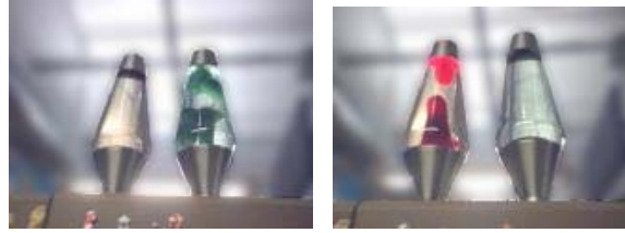
Fig.1 The two Java Lava Lamps used to display the build status.

Savoia [6] has created an ambient feedback device for continuous integration, the Java Lava Lamp . There are two lava lamps involved, one green and one red (Figure 1). The green lamp represents a successful build, and the red lamp a build in which one or more tests have failed. Timing is also significant; because the lamps take a few minutes to warm up, the bubbles mean the lamp has been on for at least several minutes. For a green lamp, this is good, however, bubbles in the red lamp indicates a problem.