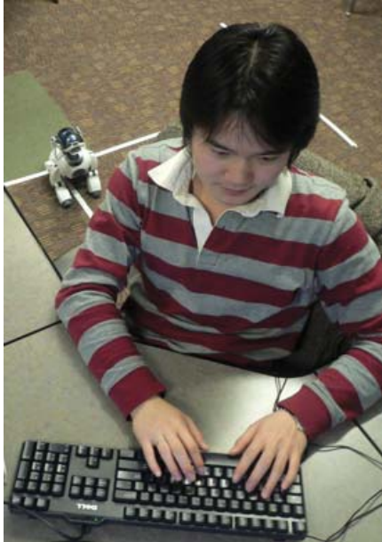
Fig.2 BuildBot arriving at a developer’s desk.

friendly ‘punishment’, BuildBot introduces more targeted accountability. It avoids potentially unpleasant confrontations (for example, between a team leader and a developer) and it introduces a mild social incentive to fix the problem without having to involve a superior.